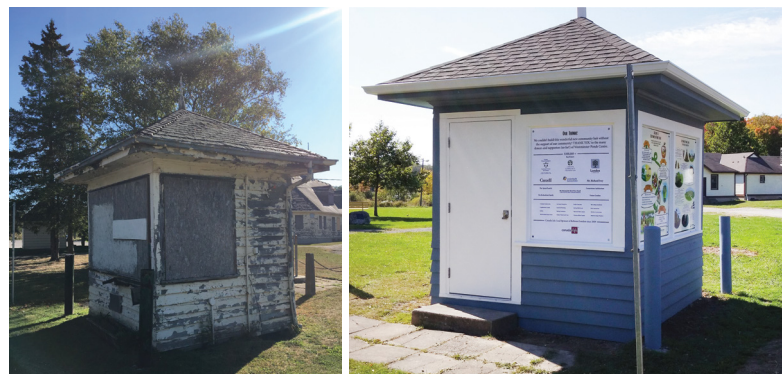
The gatehouse before and after its restoration.

In 2019, we fully restored the historic gatehouse at the entrance to the property, which now hosts a number of signs explaining the property's history, including that of the First Nations and veterans, as well as the exceptional natural heritage found within the Westminster Ponds Environmentally Significant Area. In the future, we hope to showcase stories of people who have been a part of the WPC property at the various stages of its development.